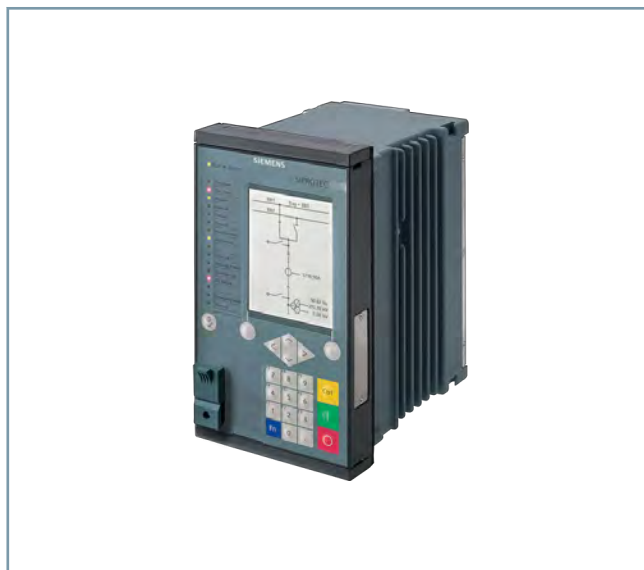
[SIP5_GD_W3, 2, --]